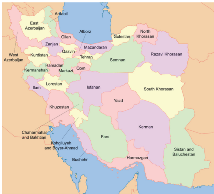
Fig. 2. The map of Iran and province of Fars

With an area of 123946 km 2 , Fars province covers about 7.5% of the total area of Iran. It is located at geographical position of 27° 3' to 31° 40' north latitude and 50° 36' to 55° 35' east longitude. This province is considered as one of the most important tourist attractions in light of having many natural, historical, geological, geomorphological, cultural-rural, and nomadic attractions at the level 1 of region.