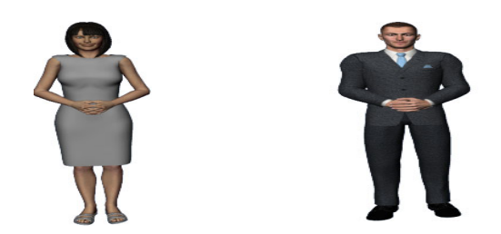
Fig. 2. The animated non-expressive naturalistic avatars

the results of the literature research also showed that the early effort in building avatars for e-Commerce information presentation relied on non-verbal may not be serious for the task in which they are deployed, designing a multimodal avatar remains a challenging task; these agents may be highly expressive, but may not fit users' need or abilities (Baylor & Kim, 2009; Al Sokkar & Law, 2013; Al Sokkar, 2014; Baylor, 2011). As well as on the results of multimodal avatar acceptance tests, which are conducted in a laboratory setting with individuals that are not representative of the population, such as a convenient sample of college students (e.g., Gazepidis & Rigas, 2009). Considering what has been said so far, this study will also be conducted in a laboratory setting with individuals and intends to determine how varying degrees of information presentation in a targeted B2C website affect consumers' tendency to buy, their attitudes toward the site's usability, and their level of satisfaction. Thus, two naturalistic avatars, humanlike avatars of both genders were conceived and generated in 3D for the purpose of presenting information.