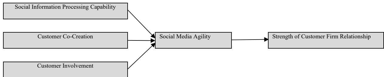
Fig. 2. The structure of the proposed study

Fig. 2 presents the structure of the proposed study.