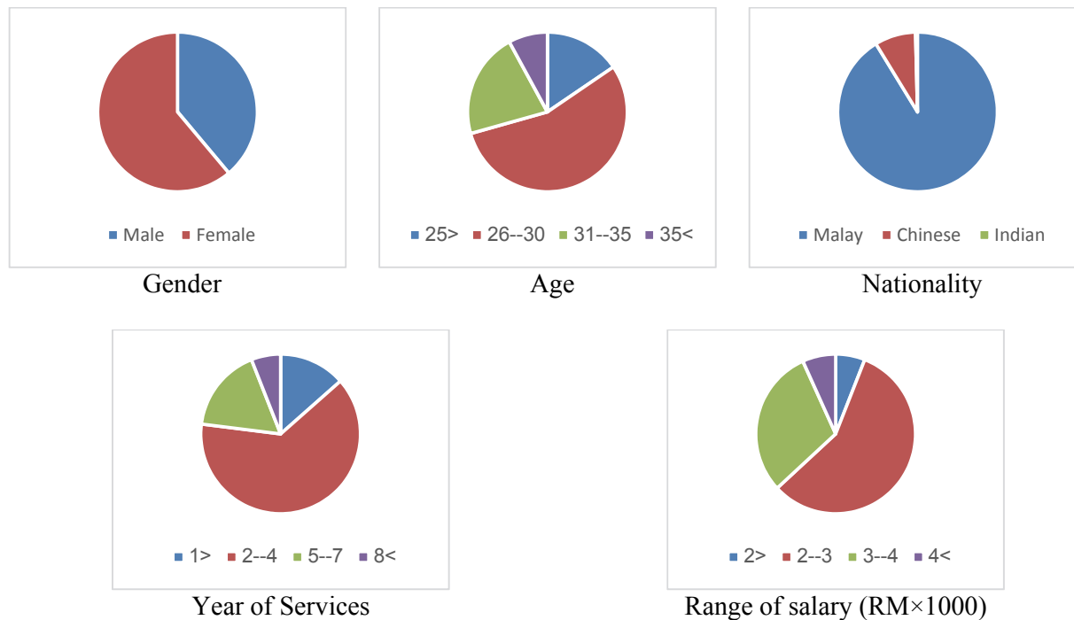
Fig. 1. Personal characteristics of the participants

Fig. 2 shows the summary of the respondent's profile among high potential employees in selected manufacturing organization in Malaysia. The results indicate that the majority of respondents were female with 61.0 percent. Meanwhile, the study shows most of the respondents were between range age of 26 until 30 years old with a percentage of 55.2 percent. Additionally, Malay participated dominantly and most of the respondents had a range of services between two to four years by 63.5 percent.